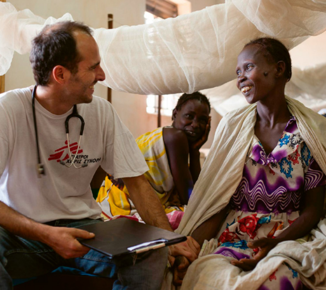
Medecins sans frontieres / Doctors without borders, www.msf.org.uk/get-involved